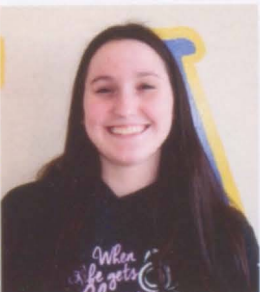
Senior portraits, student interests, voc. education