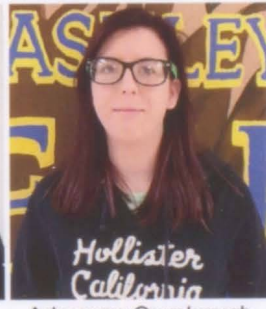
Academics, prom, 5th grade, 6th grade, seniors